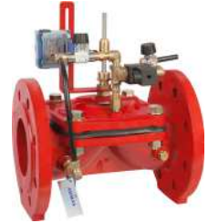
Deep well pump control valve 4" up to 12"