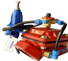
Metal pressure relife valve plastic pilot 2" up to 3"