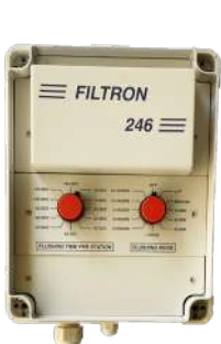
Talgil staion 2-4-6 controller