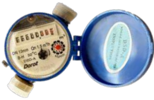
Dorot multi and single jet water meters 1/2" up to 2"