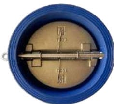
Non return Valves split disk type 1.5" up to "20 PN 16-10