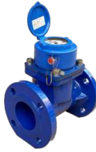
Dorot Irrigation water 2" up to 12" meter