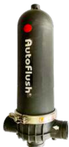
Automatic Disc Filter 3" 35 m3/h 11 m3/h for flushing