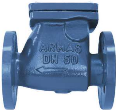
Non return Valves swing type 2" up to "8 PN 16-10