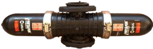
3"filter 40 m3/h