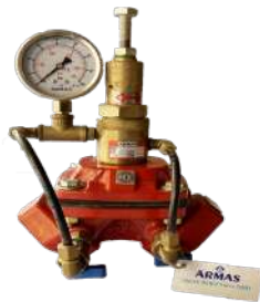
Metal pressure relife valve brass pilot 2" up to 3"