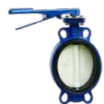
Butterfly Valves wafer/Lug with hand or Gear box 1.5" up to "16