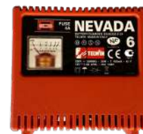
chargare 220 Ac / 12 Dc