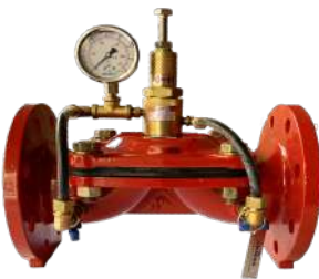
Metal pressure relife valve brass pilot 2" up to 12"