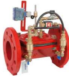
centrifugal pump control valve 4" up to 12"