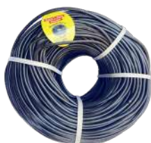
8 mm Command pipe