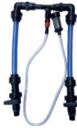
Indian/ Turkish venturi 4/3"-1"-1.5"-2"