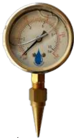
1/4" 65mm Stainless steel Pressure gauge glycerin from zero bars to 6 or 10