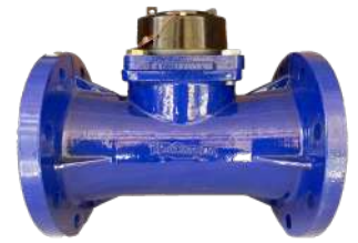
Turkish Turbo up 8" water meter