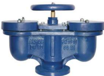
ARMAS 2" up to 8"