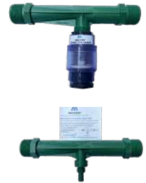
Mazzei venturi 4/3"-1"-1.5"-2"