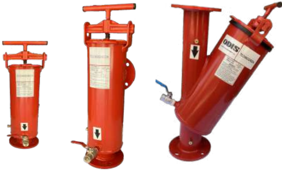
3"- 4" steel filters 80-100 m3/h