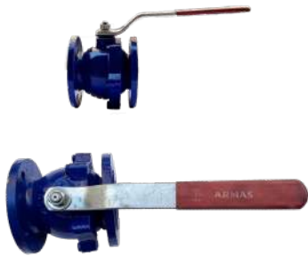
Metal ball valve PN 16-10-6 1.5"-6"