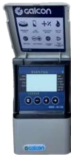
Galcon 4staion controller