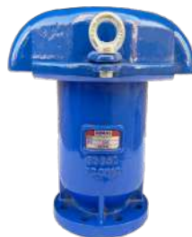
ARMAS 3" up to 12"