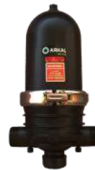
2"filter 25 m3/h