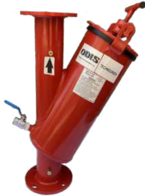
Screen Filter 4"-6"-8"-10" 100-250-350-500-650 m 3 /h