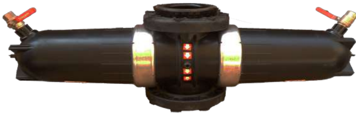
6"filter 160 m3/h