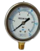
Plastic Needle 1/4"