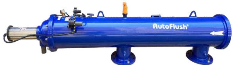
Automatic Screen Filter Hydraulic / Electric 4"-5"-6"-8" 100-120-160-200 m3/h 30 m3/h for flushing 30 sec