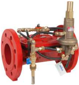
Flow control valve 2" up to 12"