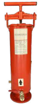
Screen Filter 3" 80 m 3 /h