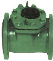
Irrigation water meter 2" up to 12"