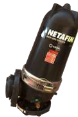
4"filter 60 m3/h