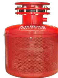
Autoflushing Foot valve with 500micron screen 6"-8"-10"-12" 180-315-495-710 m3/h