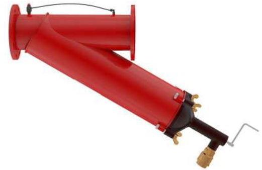
6"-8" Screen filter wz scanner or brush 160-300 m 3 /h