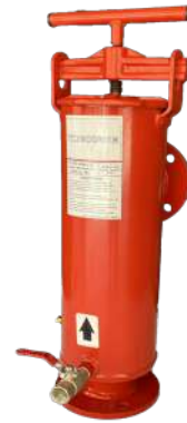
Screen Filter 4" 100 m 3 /h