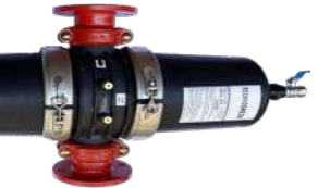
3"filter 50 m3/h