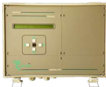
Talgil 12staion controller