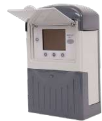
Talgil staion 2-4-6-8-10 controller