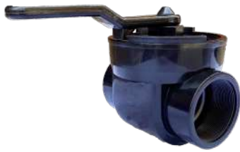
polypropylene indian ball valve Anti chemicals PN 10-6 2"-3"