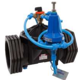
Plastic pressure relife valve plastic pilot 1.5" up to 4"