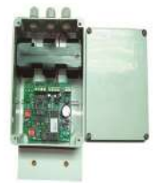
Talgil 3staion controller