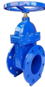
Gate valve PN 16-10 2" UP TO 12"