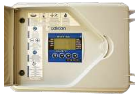
Galcon staion 9-12 controller