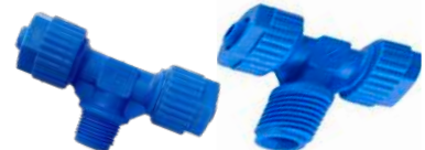
8mm*1/8 or 1/4*8mm Tee