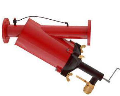
4"-6" filter wz scanner or brush 100-160 m 3 /h