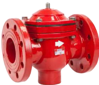
Armas 2"x 2"x 2" 3"x 2"x 3" 4"x 3"x 4"