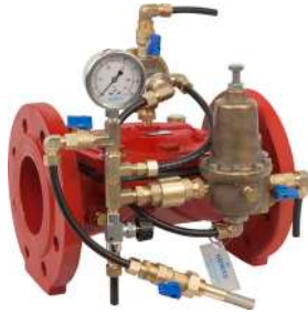
surge anticipating valve 2" up to 12"