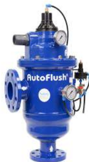
Automatic Screen Filter Hydraulic / Electric 2"-3"-4" 25-50-100 m3/h 15-20-22 m3/h for flushing 16 sec