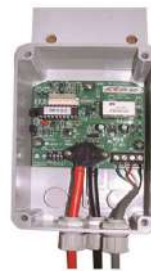
Differential pressure gauge