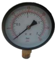
1/4" Brass carrot