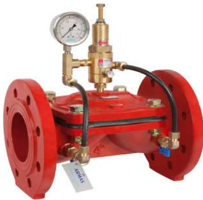
Pressure Sustaining valve 1.5" - 12"