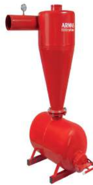
Hydrocyclone 2-3-4-5-6-8 " 14-33-59-93-135-235 m 3 /h