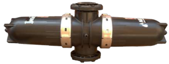
4"filter 100 m3/h