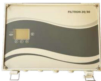
Talgil up to 30staion controller